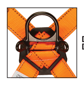
DORSAL D RING