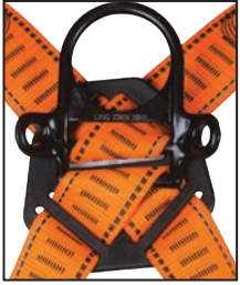
DORSAL BARR D RING