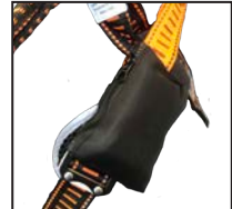
SUSPENSION TRAUMA POUCH